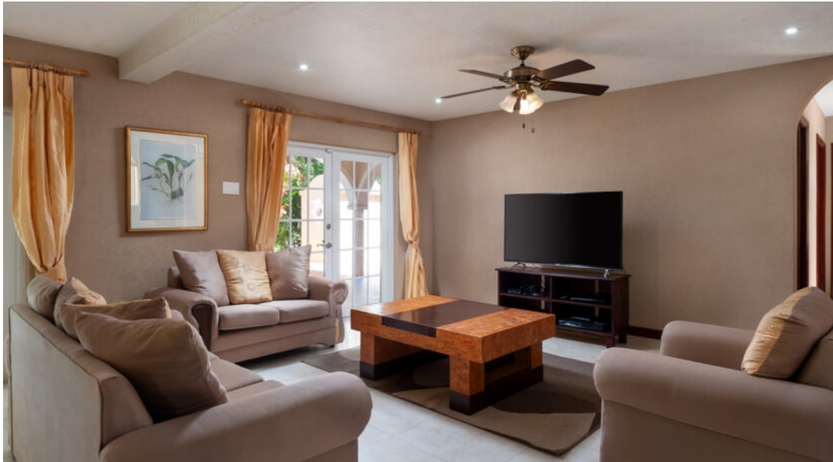
5 BEDROOMS 4 BATHROOMS - DETACHED VILLA US $5,250 PER MONTH

Barbados : +246-432-6307 Indigo Court, Holetown, Barbados Email: enquiries@longtermrentalsbarbados.com