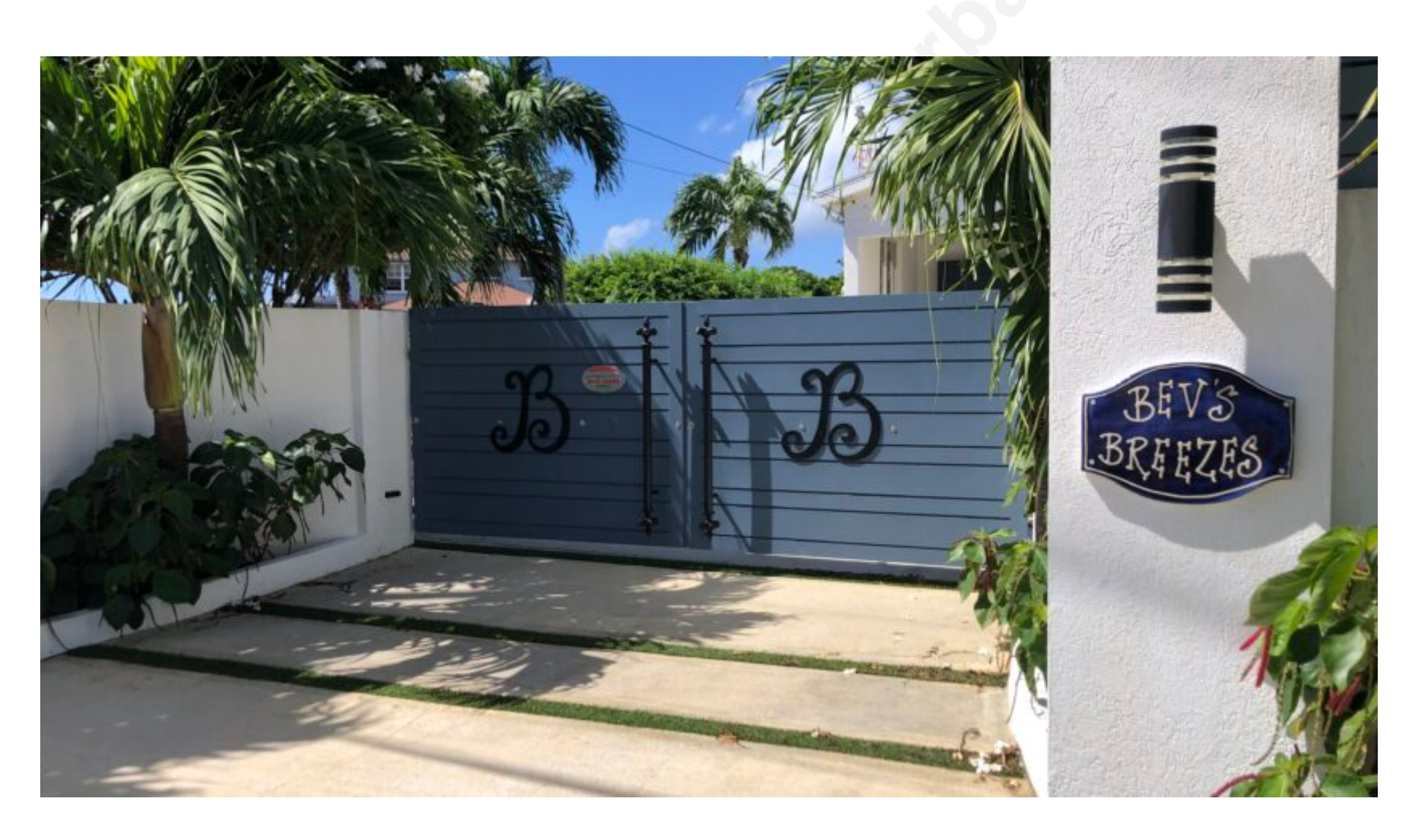
3 BEDROOMS 3 BATHROOMS - LUXURY VILLA US $5,000 PER MONTH