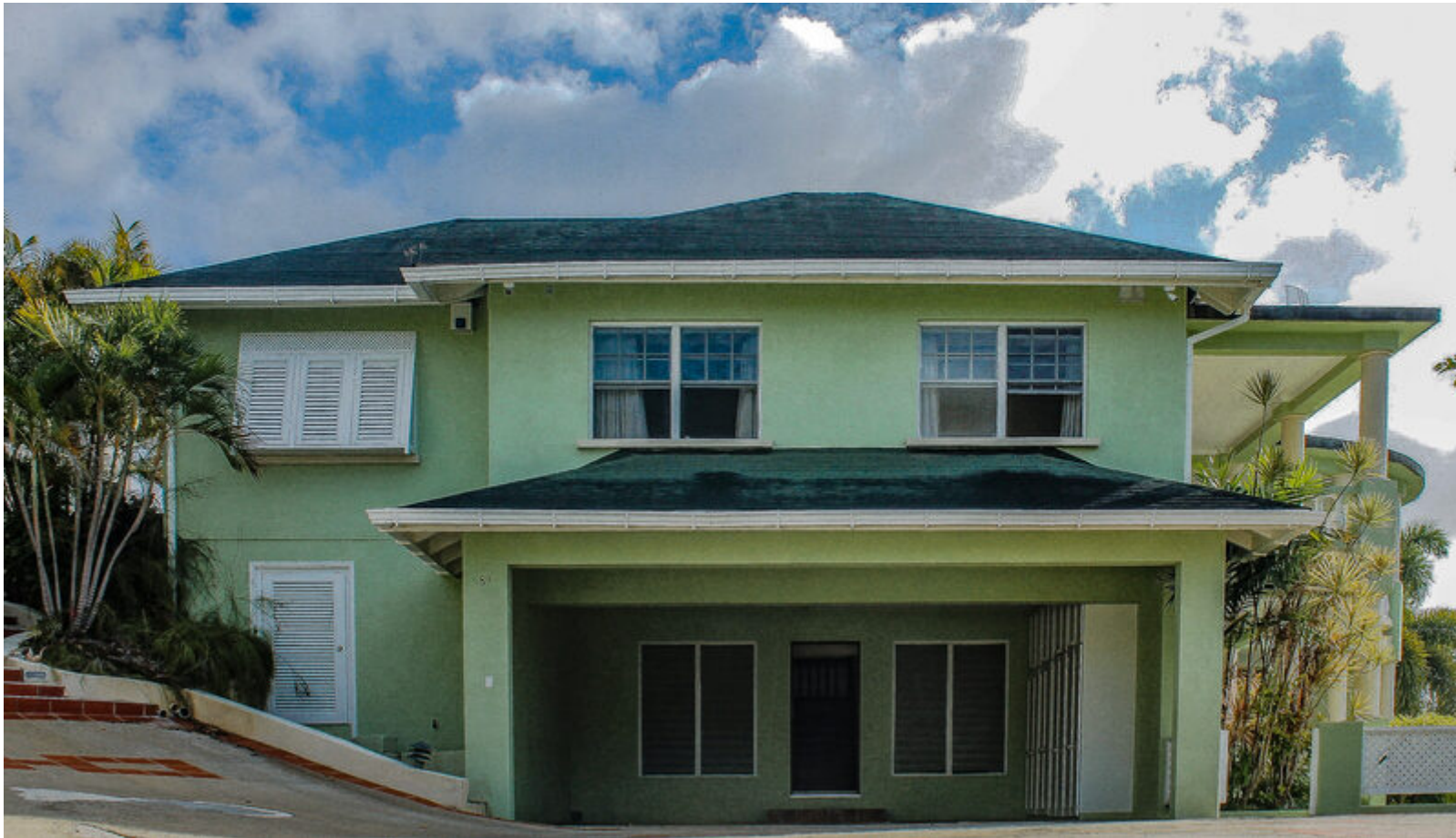
4 BEDROOMS 3 BATHROOMS - GATED DEVELOPMENT, LUXURY VILLA US $3,750 PER MONTH

Barbados : +246-432-6307 Indigo Court, Holetown, Barbados Email: enquiries@longtermrentalsbarbados.com