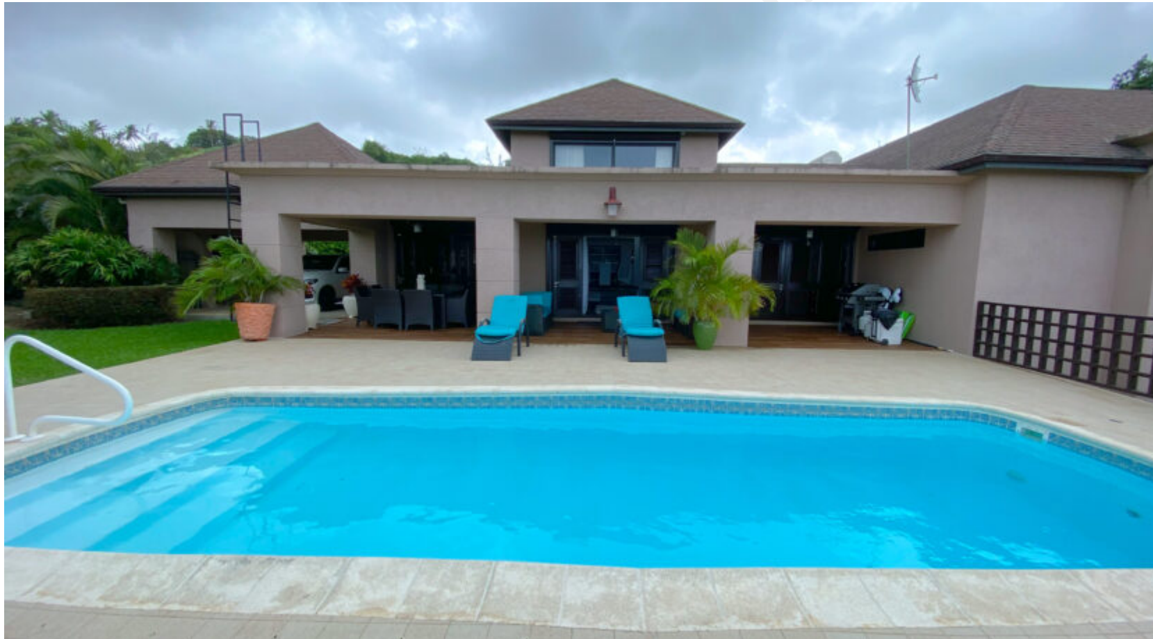
4 BEDROOMS 4.5 BATHROOMS - DETACHED VILLA US $6,000

Barbados : +246-432-6307 Indigo Court, Holetown, Barbados Email: enquiries@longtermrentalsbarbados.com